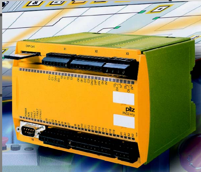
Sicherheitsschaltgerät, Typ PNOZmulti from company Pilz GmbH & Co. KG